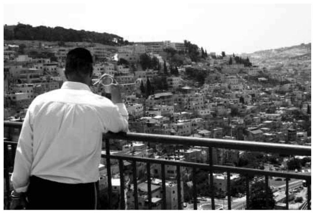
Overview of Silwan from the City of David archaeological site.

possible to discover which provisions of the plan are really achievable and, conversely, which provisions appear to be non-achievable.